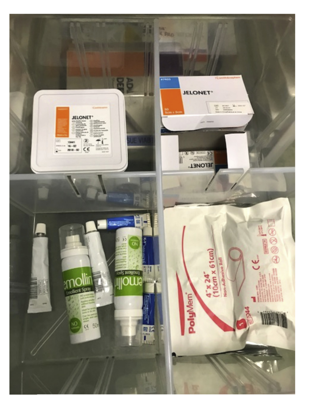
Fig 3 Equipment and dressings required.

Smooth emergence is as important as smooth induction of anaesthesia. All airway adjuncts should be removed before emergence and all hard plastic oxygen face masks should be avoided. Oxygen during recovery should be delivered with the cushioned and lubricated anaesthetic mask or towards the patient without direct skin contact, guided by SpO2 values. Methods to avoid overstimulation include maintaining a darkened and quiet recovery area and allowing the child to waken up naturally without stimulation.