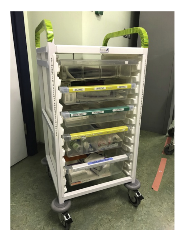
Fig 2 A designated EB trolley containing equipment necessary for management.

using lubricated ribbon/paraffin gauze with an underlay of further lubricated gauze to prevent shearing. The lubricated gauze can be secured adhesively to the actual endotracheal tube to prevent inadvertent migration of this.7 Laryngeal mask airways have been used successfully with minimal sequelae as long as they are well lubricated and applied gently. 14 Pharyngeal suctioning should be done gently and only under direct vision, taking care to avoid direct trauma to the oral mucosa.